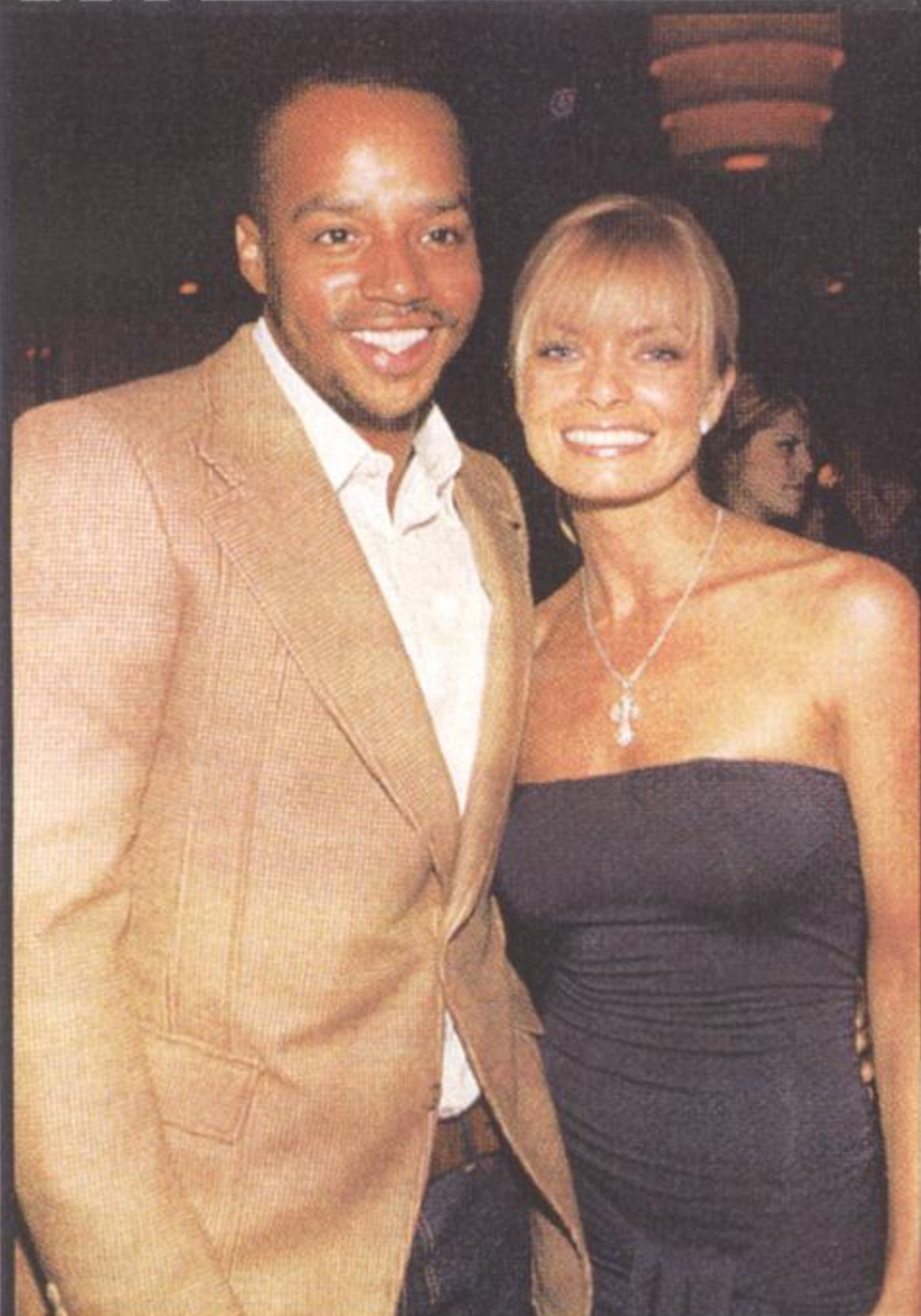
Donald Faison and Jaime Pressly at "Hot in Hollywood"