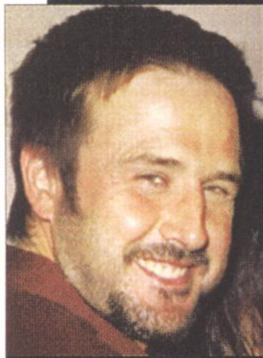
David Arquette at the Comedy Store

"The only thing celebrity is good for is getting a good table at a club and raising money for people who need it."