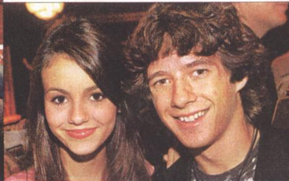
Victoria Justice and Matthew Underwood at "Hot in Hollywood"

"There's nothing I like better than bingo and drag queens."