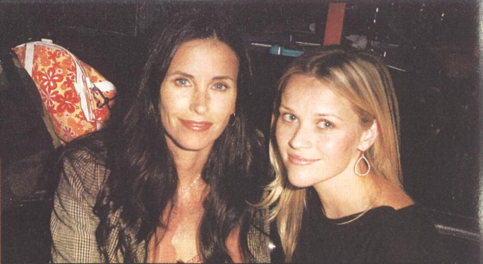
Courteney Cox Arquette and Reese Witherspoon at the Comedy Store